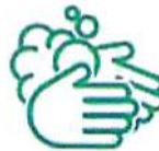
Wash or Sanitize your Hands