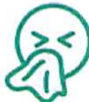
Cough/Sneeze into your Elbow or Tissue