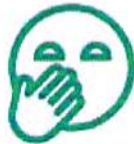
Do Not Touch your Face